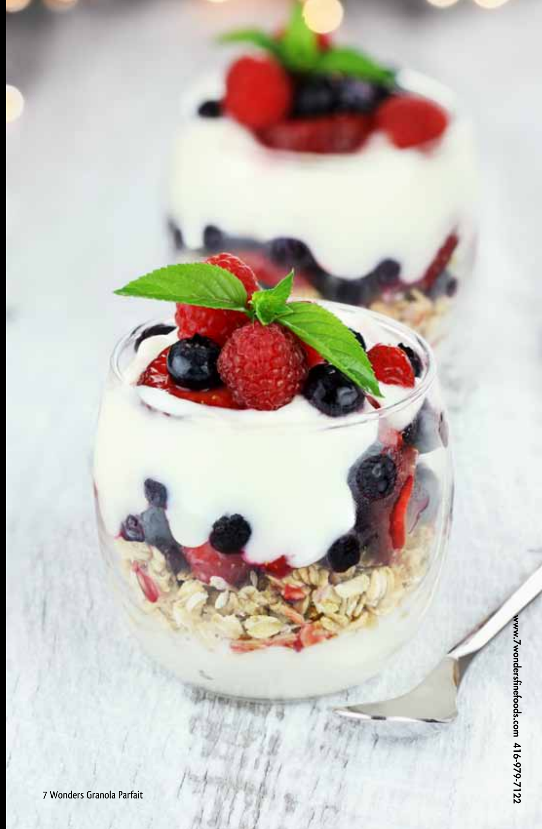
7 Wonders Granola Parfait