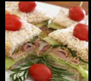
Gourmet Tea Sandwiches