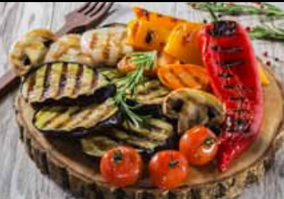
Grilled Veggie Platter

This fresh & juicy fruit platter will make your mouth water. Also available in mixed berries, served with a side of real whipped cream.