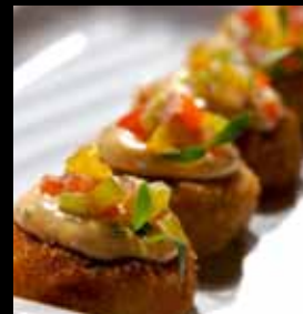
Mini Crab Cakes