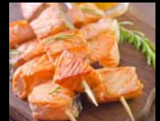
Grilled Salmon Kebabs