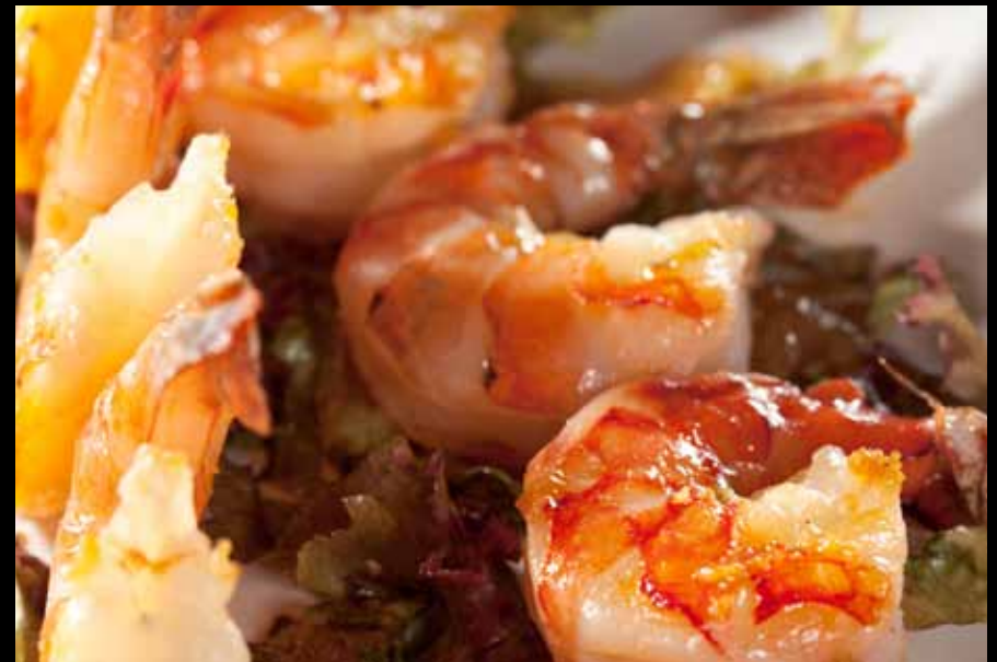
Sizzling Shrimp Kebabs