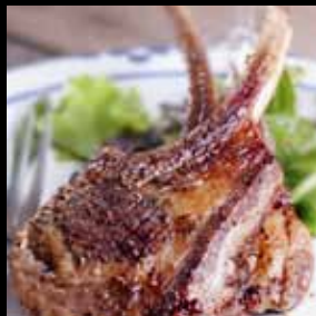
Oven Roasted Lamb Chops

Juicy oven-roasted pork loin, served with mashed potatoes and tender roasted vegetables.