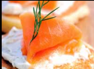
Smoked Salmon Platter