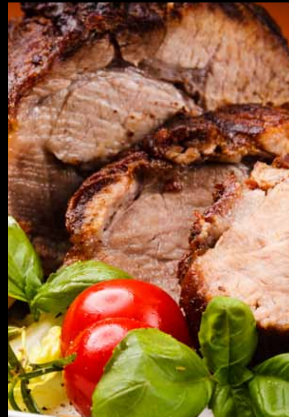
Egyptian Oven Roast Beef