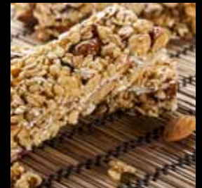
Granola Bar Platter