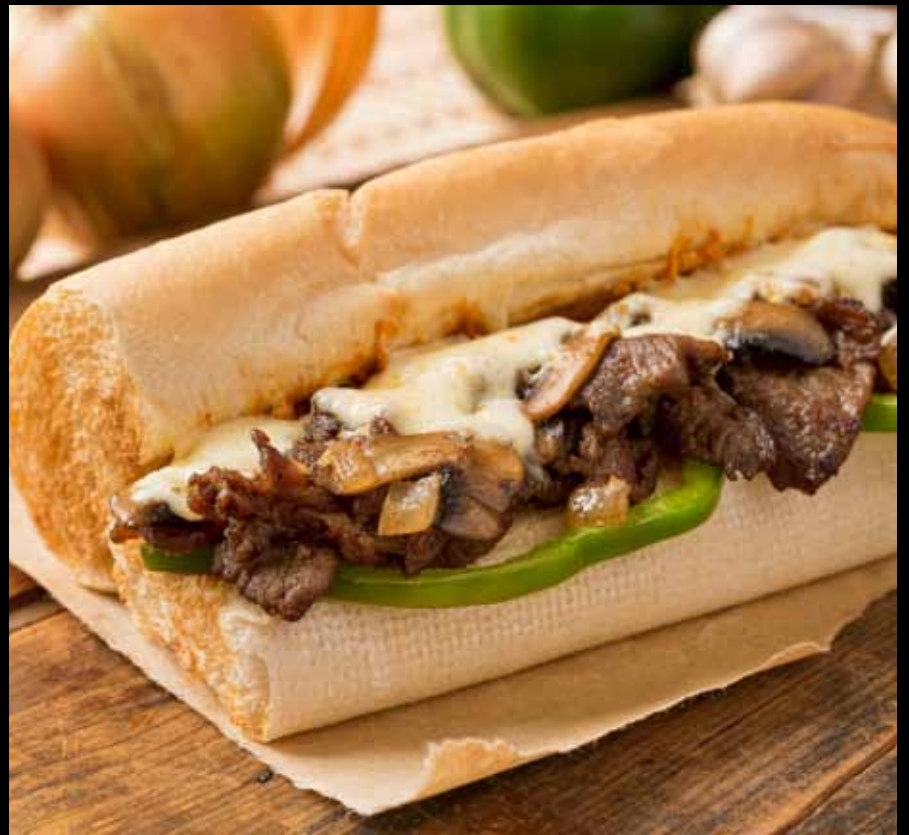
Philly Cheese Steak Sandwich