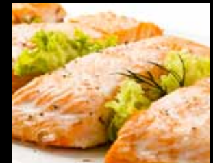
Grilled Atlantic Salmon