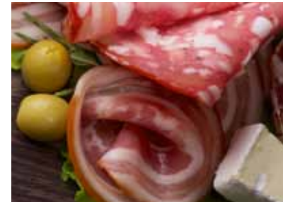
Dairy & Deli Platter