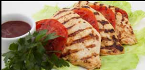
Montreal Grilled Chicken