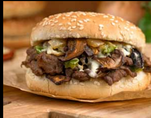
Mini Philly Steak Sandwiches